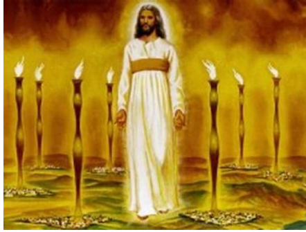
Seven golden lamps

A lamp ( Ps 19:7, Ps 119:105, Pr 6:23, Rev 11:4, Ex 25:31 ) in scripture speaks of God’s law it’s His lamp His word, His salvation, His oil, His light shining forth in darkness lighting the way for redemption and what’s to take place.