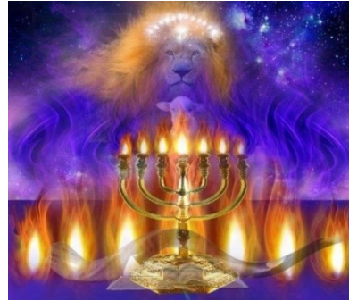
Seven Spirits of God

A certain term referring to the two witnesses is found mentioned in Zachariah 4:6 “ Not by might ( mans strength ) nor by power ( mans power ), but by My Spirit ( seven-fold Spirit ), Says the Lord of hosts ” (NKJV).