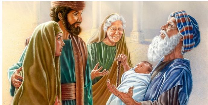
Jesus Presented in the Temple

The two witnesses Rev 11 temple vision, are two real individuals they are virtually the last two Christian Martyrs recorded in the Bible prior to the 7 th trumpet the 7 th seal and the 7 th bowl wrath of God at Christ's second coming. These two witnesses are on the earth “now” in our 21 st century generation in preparation for ministry. With Gods prompt on finishing with what He began with in Eden a man and a woman, you can find a similar pattern of this in the Bible. When Jesus was a baby being dedicated in Herod's temple you find two witnesses/prophets a man and a woman “ Anna and Simeon ”, whom God used to witness about the Christ before Joseph and Mary. Both “ Anna and Simeon ” had the Holy Spirit on them as they witnessed of finally seeing the baby Messiah the Christ the salvation of the world. Then they were moved by the Holy Spirit and prophesied over baby Jesus as a testimony.