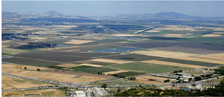
The Valley of Armageddon looking east from the top of Mount Carmel

nations fighting Israel at His return and destroys them in the midst of direct conflict this destruction is seen in Ez 38 and 39, Rev 11:15-19. This ends with the “Great and Dreadful Day of the Lord” His 7 th Trumpet wrath.