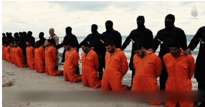
Isis beheading 21 Egyptian Christians in Libya 2015

Daniel 8:9-12 “Because of transgression an army was given over to the horn to oppose the daily sacrifice and he cast truth down to the ground” , Daniel 8:23 “And in the latter time of the kingdom when the transgressors have reached their fullness. A king shall arise having fierce features who understands sinister schemes”, Daniel 9:27 “Then he shall confirm a covenant with many for one week but in the middle of the week he shall bring an end to sacrifice and offering. And on the wing of abominations shall be one who makes desolate”, Daniel 11:31-32 “He shall make war with the saints and against God” (NKJV)