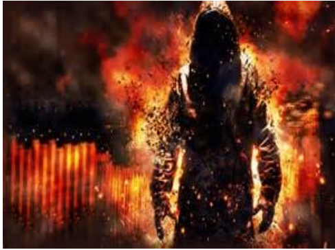
George Walker Bush 2001 - 2009

president was elected in 2001 and 9/11 came “Isaiah29:25-26” he was president from 2001-2009 the “Man of fire” then the 44 th president Obama came in 2009-2017 the second larger “Beast of fire” the “Antichrist” man of sin of Rev 13:1-10).