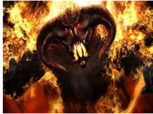
Barak Hussein Obama 2009 – 2017