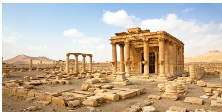
Palmyra, Syria: Baal Shamen, Temple of The Temple of Baal Shamen, Palmyra, Syria.

In the days of Elijah the people were worshipping the false God Baal the God of weather and fertility worshipped under Jezebel as found in 1 Kings 18:19-21. In many of the years of Israel they were worshipping Baal as seen in the examples of 2 Kings 1:6, 2 Kings 10:19, 2 Kings 21:3 and 2 Kings 23:4-5. Baal means “Owner” to be enslaved to it was from Canaan that Baal worship spread out to Egypt and the Mediterranean. The Arch of Baal/Triumph was blown up by Isis in the ancient city of Palmyra in Syria in 2015. It was then recreated by wicked powers influencing governments. This arch was placed at G7 meetings it was placed in front of the White House with the Brett Kavanaugh hearings as they were afraid if he was confirmed he could stop child abortion in USA. The sacrifice of children passing them through the fire is Baal worship, it’s a demonic gateway.