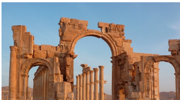
Arch of Baal before it was destroyed by Isis in 2015

In the days of Elijah the people were worshipping the false God Baal the God of weather and fertility worshipped under Jezebel as found in 1 Kings 18:19-21. In many of the years of Israel they were worshipping Baal as seen in the examples of 2 Kings 1:6, 2 Kings 10:19, 2 Kings 21:3 and 2 Kings 23:4-5. Baal means “Owner” to be enslaved to it was from Canaan that Baal worship spread out to Egypt and the Mediterranean. The Arch of Baal/Triumph was blown up by Isis in the ancient city of Palmyra in Syria in 2015. It was then recreated by wicked powers influencing governments. This arch was placed at G7 meetings it was placed in front of the White House with the Brett Kavanaugh hearings as they were afraid if he was confirmed he could stop child abortion in USA. The sacrifice of children passing them through the fire is Baal worship, it’s a demonic gateway.