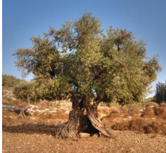
olive tree in Hilazon creek

Olive oil was used as a cooking oil, food, lighting fuel, soap making, religious ceremonies and medicinal use. Its production was one of the major sources of income in the Holy Land over thousands of years, including modern times when the olive oil is an essential ingredient in the Middle East cuisine.