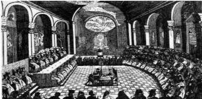
A session of the Council of Trent, from an engraving

(Palestine was a nonexistent nation at the time of Johns prophecies in the 1 st century and still is today, it is still not recognized as a nation. So it actually doesn't exist as a nation only an entity even as of 2022, yet they fit it into men's prophecy theology).