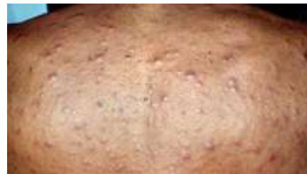
Debilitating skin disease called leishmaniasis