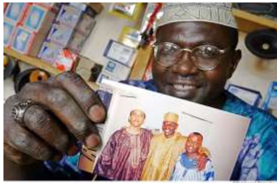
Obama dressed as a Muslim His brothers photo

Obama’s Denver 2008 Presidential candidate speech from his “ Pergamum Alter ” stage design copy of the biblical “ Seat of Satan ” a coincidence ? once again I think not.